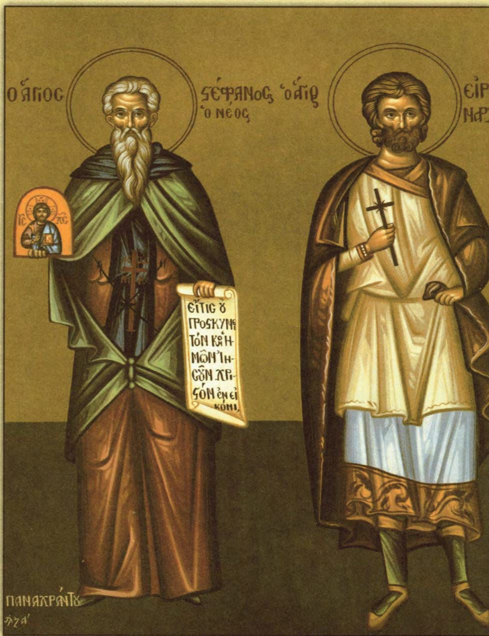
Icon of Saints Stephen and Irenarchus -- November 28th