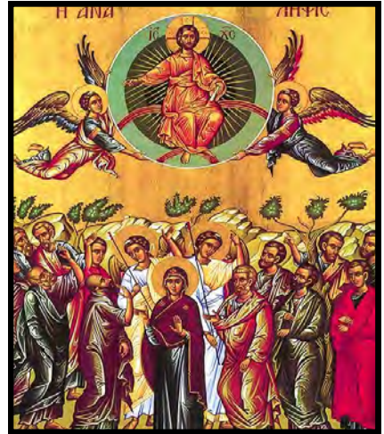
Life's Journey Is an Ascension to

Think about what this suggests. God, through His incarnation as a human in the Person of Jesus,