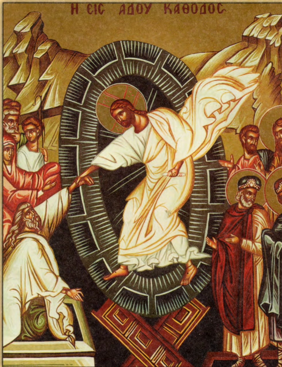
Icon of the Descent into Hades